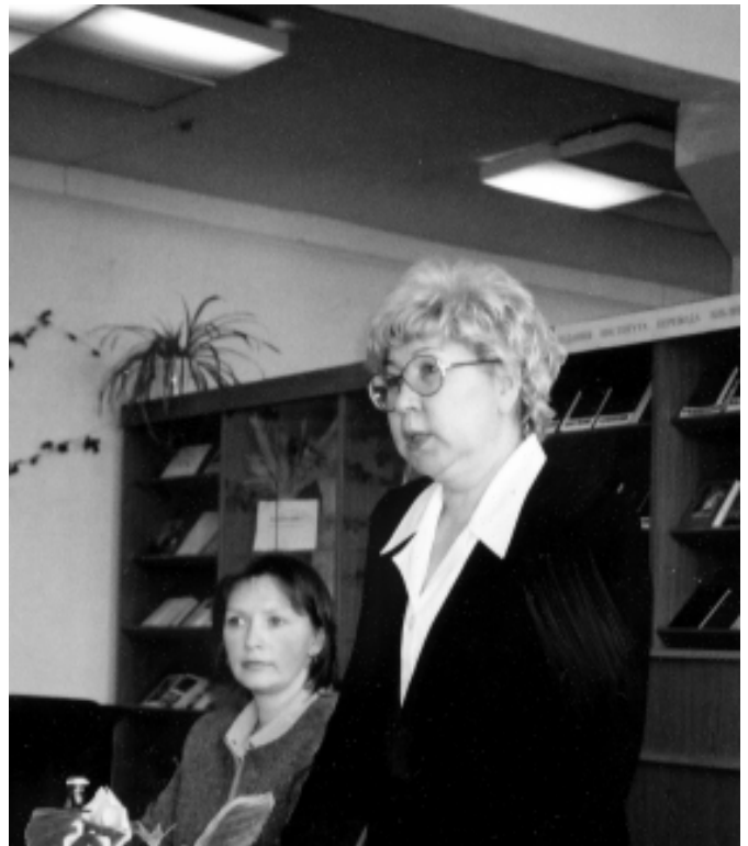
Chuvash Minister of Culture Olga Denisova