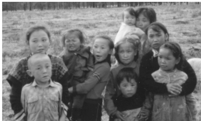
The Children's Bible has also been published in Tuvian