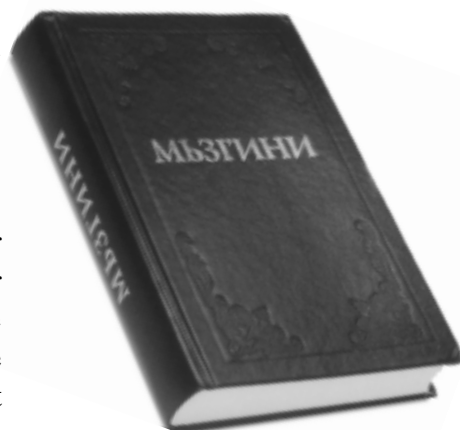
The Kurmanji-Kurdish New Testament

In 1998, IBT marked its 25 th Anniversary. That year also saw the initiation of the “Target 2005” project, an effort to complete the New Testament in 15 languages of the former Soviet Union by the year 2005. Six of these 15 New Testaments are soon to be printed!