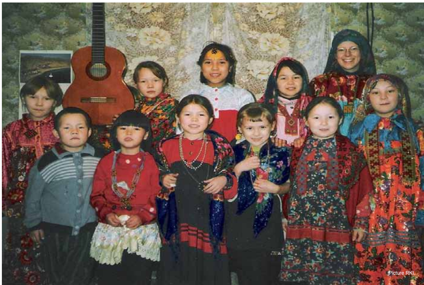
Khanty Sunday School Children